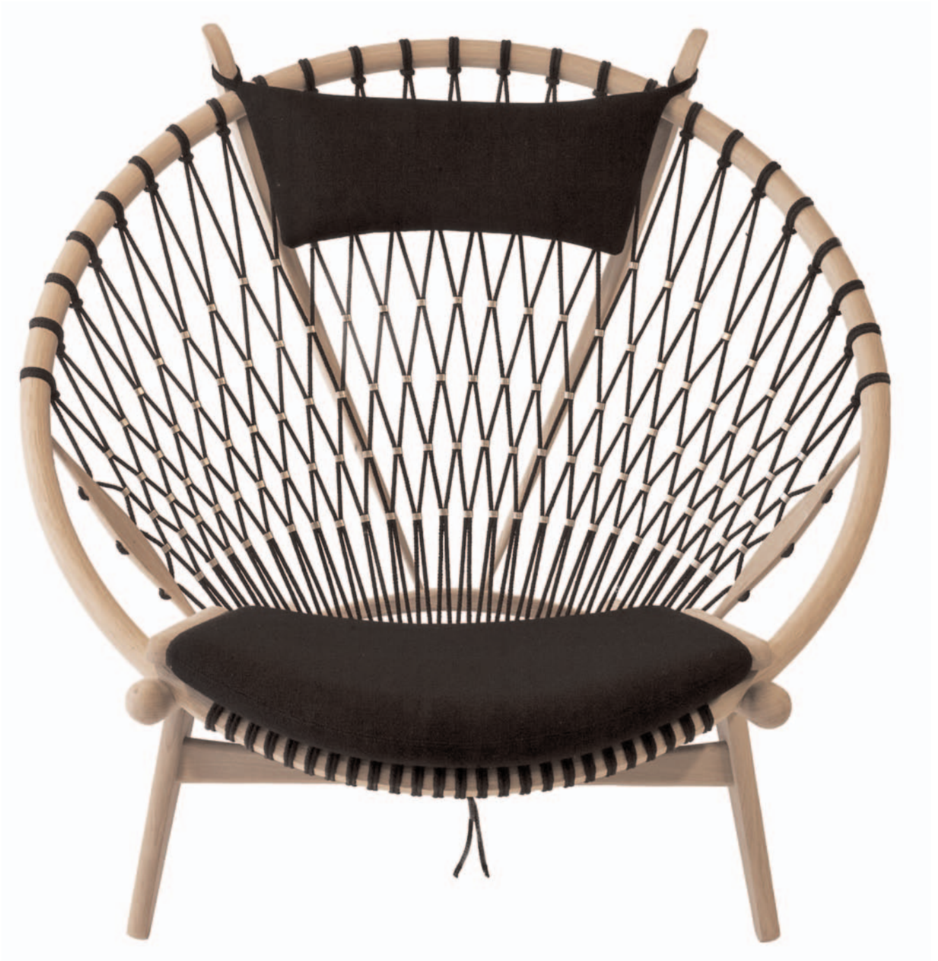
"Circle Chair" pp 130 Design Hans J. Wegner 1986