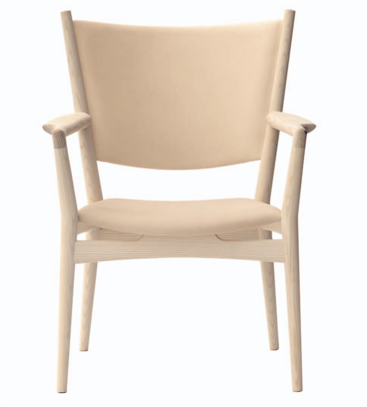
“Conference Chair” pp240 Design Hans J. Wegner 1990