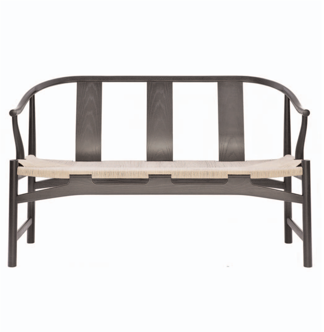
“Chinese Bench” pp 66 Design Hans J. Wegner 1946