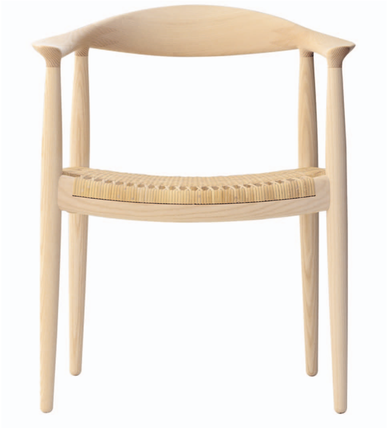
"The Chair" pp 501 Design Hans J. Wegner 1949