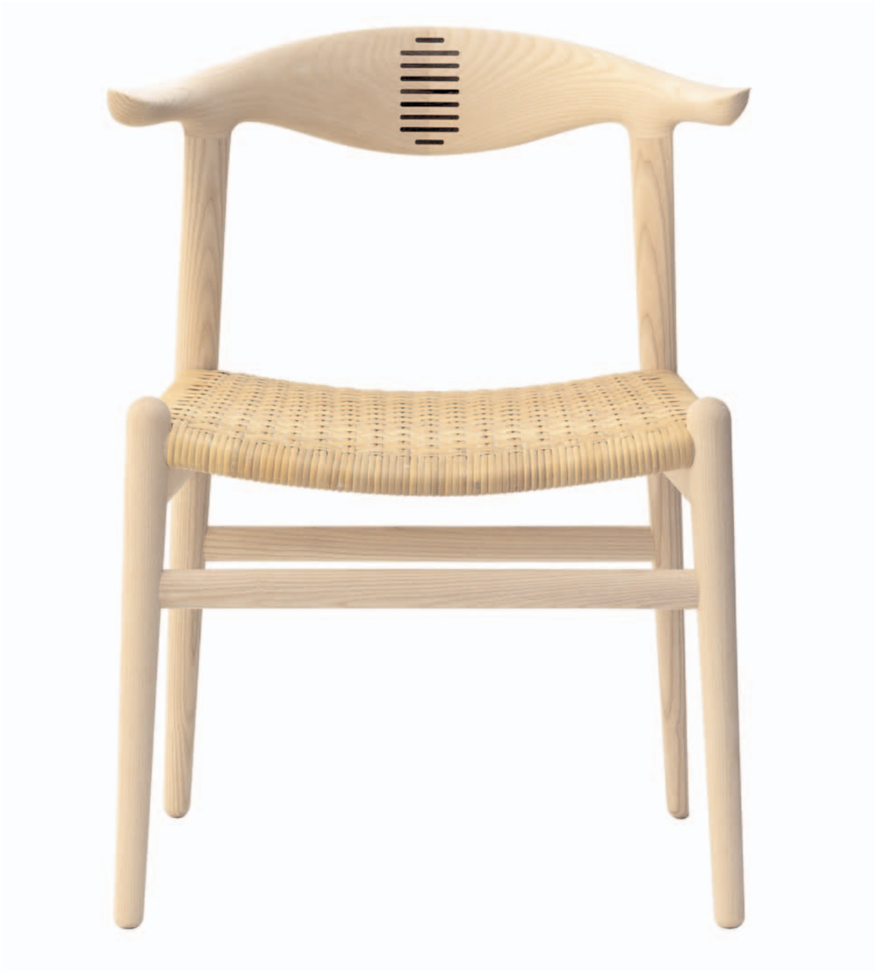
“Cowhorn Chair” pp505 Design Hans J. Wegner 1952