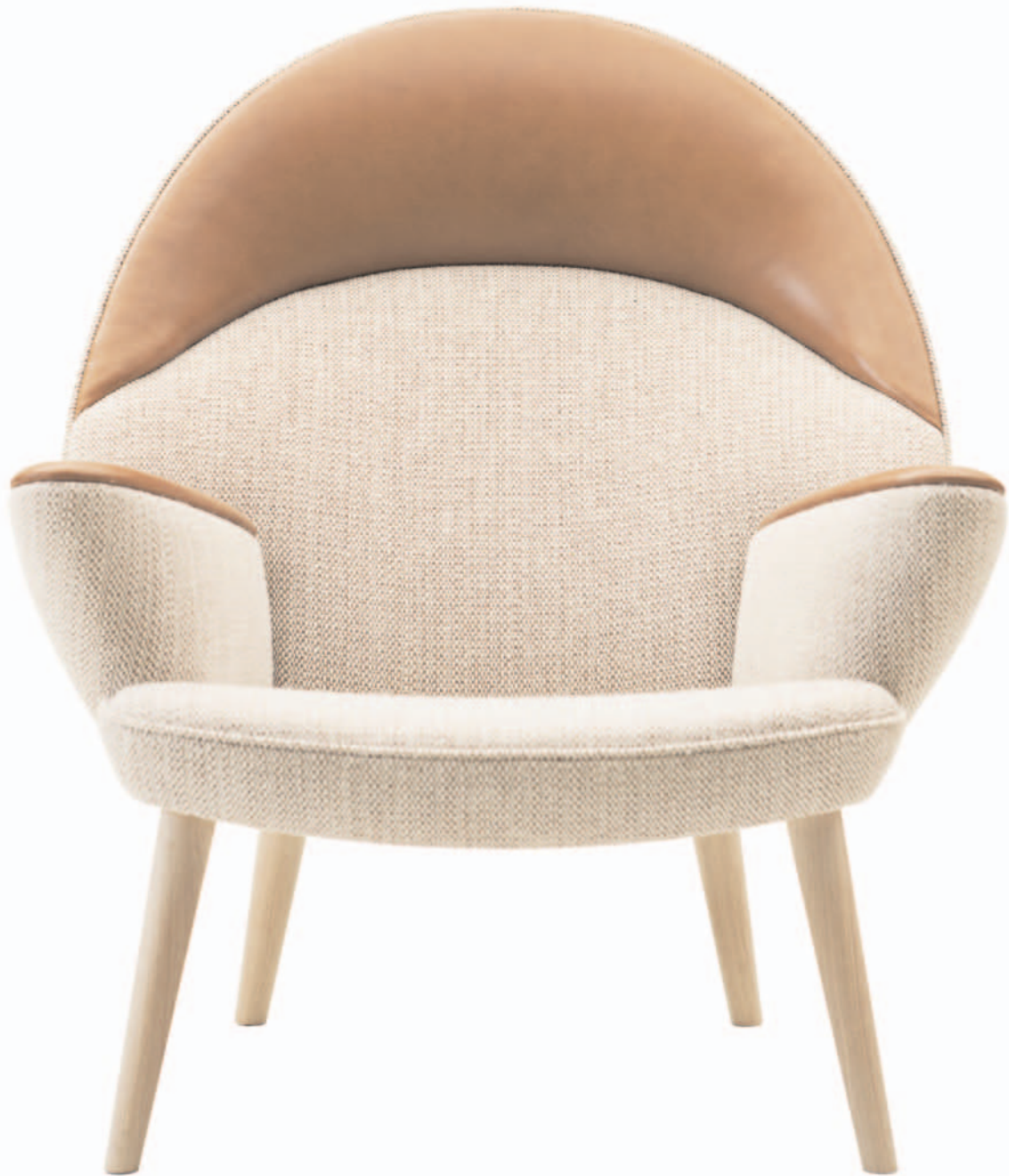
“The upholstered Peacock” pp 521 Design Hans J. Wegner 1954