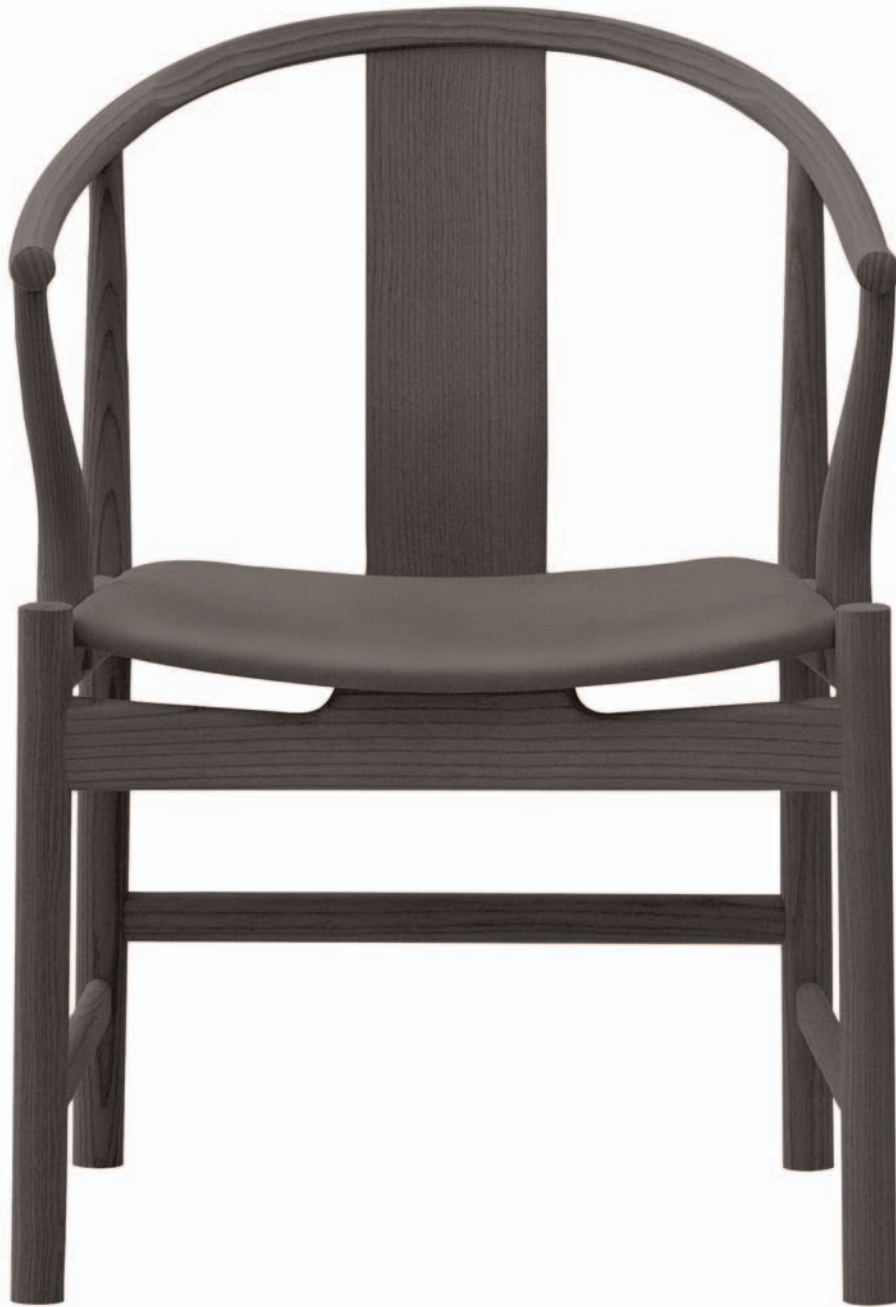
“Chinese Chair” pp 56 Design Hans J. Wegner 1989